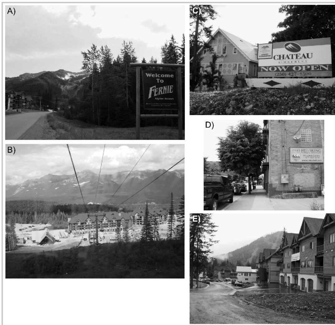
FIGURE 2 Many British Columbian interior towns, which in the past had relied on extractive industries such as forestry and mining, are gradually transforming into resort towns. Study locations: (A) View of Fernie Alpine Resort; (B) the Kicking Horse Ski Resort in Golden; (C) a mining headquarters transformed into a hotel in Kimberley; (D) a heli-ski business in downtown Revelstoke; and (E) Rossland's Red Mountain Ski Resort condominiums.

The town is a short distance from Mount Revelstoke (1943 m) and Glacier National Park. One of the key elements under consideration for development is Mt. McKenzie (2143 m), which used to be a community ski hill. Renamed as the Revelstoke Mountain Resort, its first resort phase was completed in 2007. The absolute number of amenity migrants has been the highest in Revelstoke, peaking in 1992 (>350 people), declining somewhat in 2006 (>270 people), and steadily rising since 2004 (Pacific Analytics Inc. 2009).